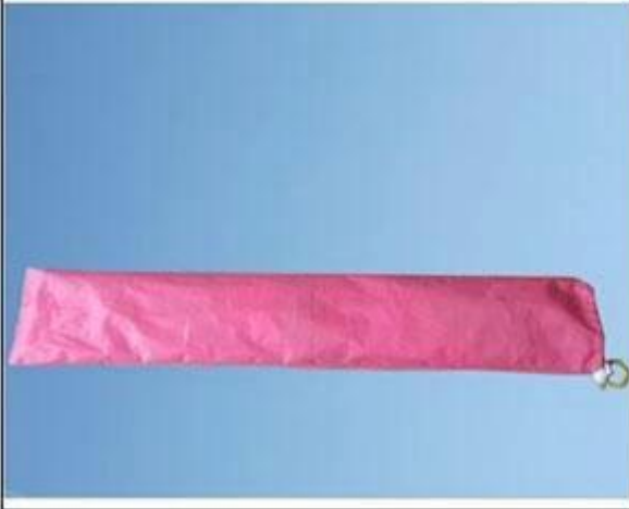
NO.3 Fabric bag