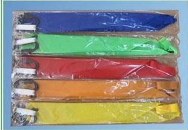
NO.3 Fabric bag