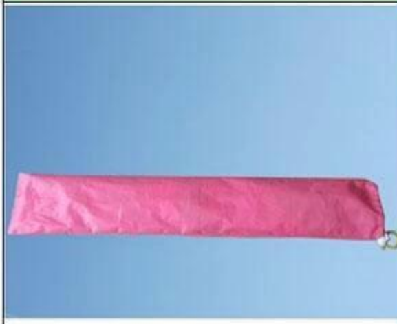
NO.3 Fabric bag