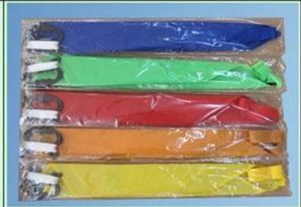
NO.2 PE bag