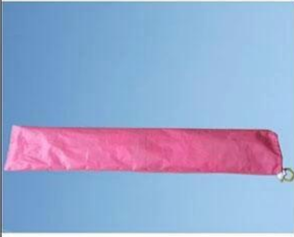
NO.3 Fabric bag